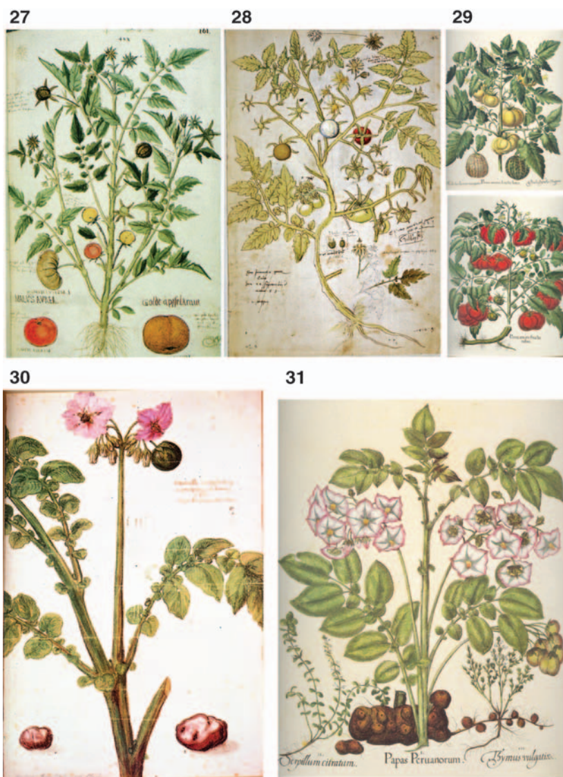
Plate 1.27-31. (27) Tomato, Fuchs' Vienna Codex 11 122, 2(3), folio 161, painted by A. Meyer 1549–1556. Note several fruit types in color, shape, and ribbing. (28) Tomato, Gesner, Manuscript MS 2386, folio 42, dated 1553. (29) Tomato, Besler (1613): (Top) Tafel 319 ; (Bottom) Tafel 320. From the original hand colored copy of the University Library Eichstaett-Ingolstadt, (30) Potato watercolor, received by Clusius in 1589. (31) Potato, Besler, Tafel 345, 1613. From the original hand colored copy of the University Library Eichstaett-Ingolstadt.