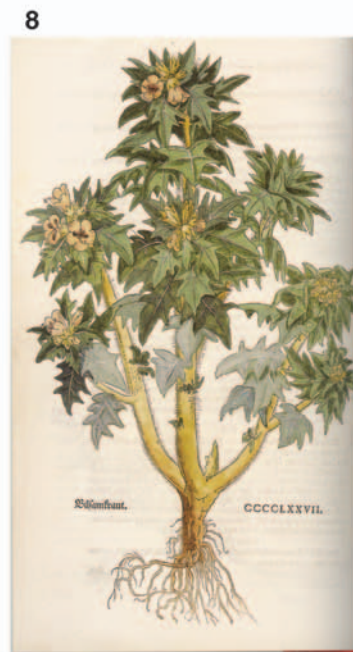
Plate 1.5-8. (5) Two lovers and mandrake in the background. Manuscript Nouvelle acquisition latine 1673, fol 85, ca 1390–1400. (6) Mandrake. Aldrovandi, Il Teatro della Natura, vol. 5-2, folio 222, 16th century, (7) Henbane. Manuscript Français 12322, folio 159, 1520–1530. (8) Henbane. Fuchs New Kreüterbüch, folio 477 (1543).