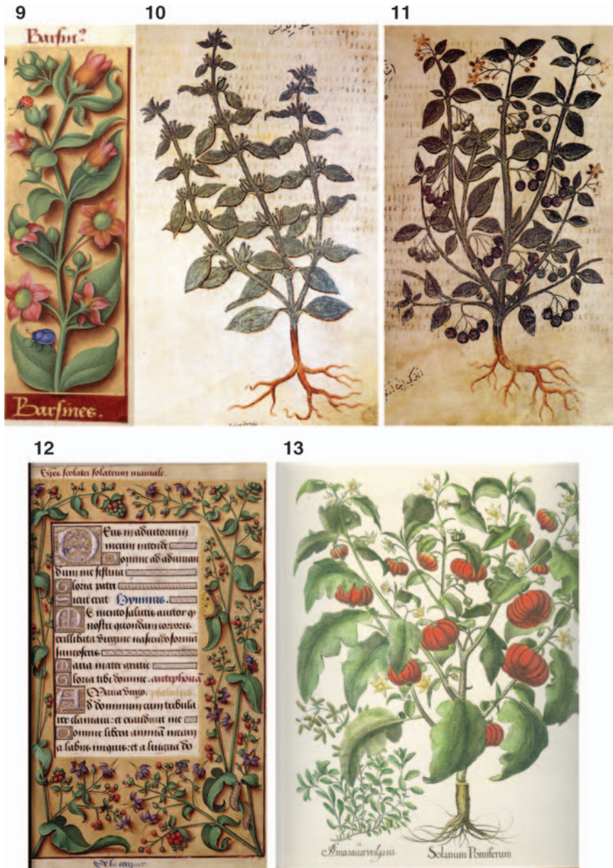
Plate 1.9-13. (9) Belladonna. Manuscript Latin 9474 Horae ad Usus Romanum, fol 237, ca. 1503–1508. (10) Putative Withania somnifera. Codex Aniciae Julianae, folio 386, 512 CE. (11) Solanum nigrum. Aniciae Julianae Codex, folio 292v, 512 CE. (12) Solanum dulcamara. Manuscript Latin 9474 Horae ad Usus Romanum, fol 59, ca. 1503–1508. (13) Solanum aethiopicum Kumba Group, Besler, Tafel 322 (1613).