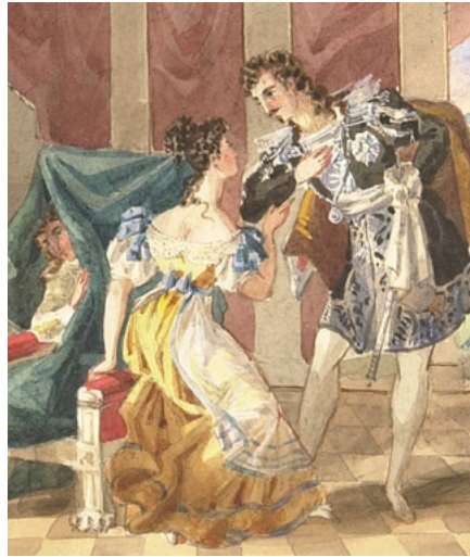
The Marriage of Figaro

Within a short time Da Ponte's seditious poems and reckless behavior led to his being banished from Venice. In his own mind, he was a roaring success: "I was loved by women, esteemed by men and full of great hope." He re-surfaced in Vienna in 1779. Using what is now called "networking" he persuaded Antonio Salieri, 1750 - 1825, to find him a post at the Emperor Josef II's new Italian theatre, writing libretti.