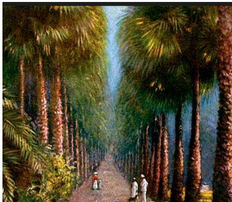
The Royal Botanic Garden at Calcutta, India