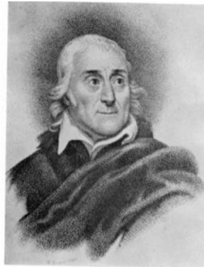
Lorenzo Da Ponte