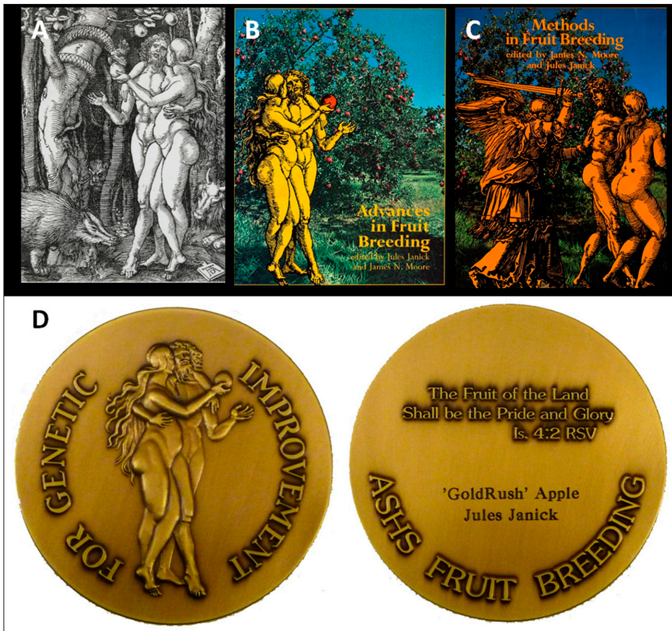
Fig. 1. (A) Image of the original 1510 woodcut by Albrecht Dürer of Adam and Eve; (B) cover of the Advances in Fruit Breeding textbook; (C) cover of the Methods in Fruit Breeding textbook; (D) Outstanding Cultivar Award medallion for 'GoldRush' apple.

Geneva, NY. 'Empire' was tested as N.Y. 45500-5 and was released in 1966 by pomologist Roger Way (McCandless, 1996). 'Empire' apples are crunchy, juicy, and sweet, with crisp, creamy white flesh. 'Empire' fruit has better coloration and resistance to preharvest drop than 'McIntosh' with similar flavor and aromatics. It is productive and has low susceptibility to fireblight. In 2009, the United States produced 6.6 million bushels of 'Empire' and it is the primary export apple in New York State.