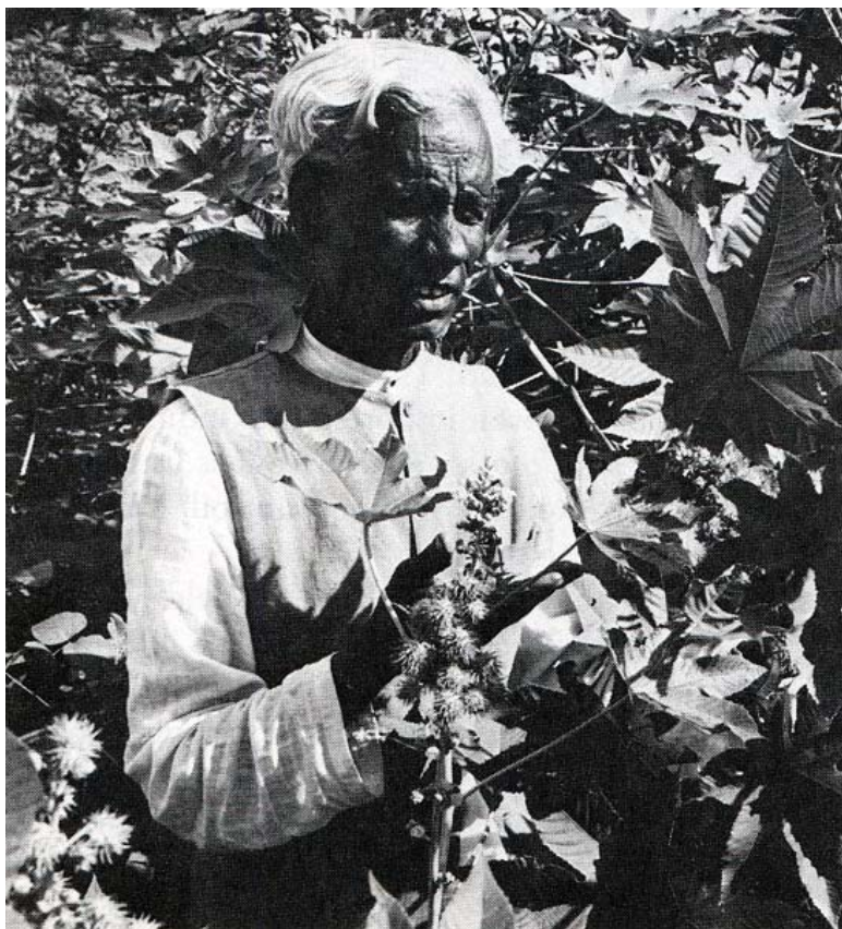
Fig. 3. An Indian farmer examines a new castor bean bred for quick maturation, near Hyderabad, India.

Corn-oil production is the “other half” of wet-milling the grain for starch (see the discussion of corn in Chapter 20). The oil-rich “germ,” or embryo, constitutes 6 to 13% of the grain. In wet milling this is freed by “cracking,” which follows the initial steeping