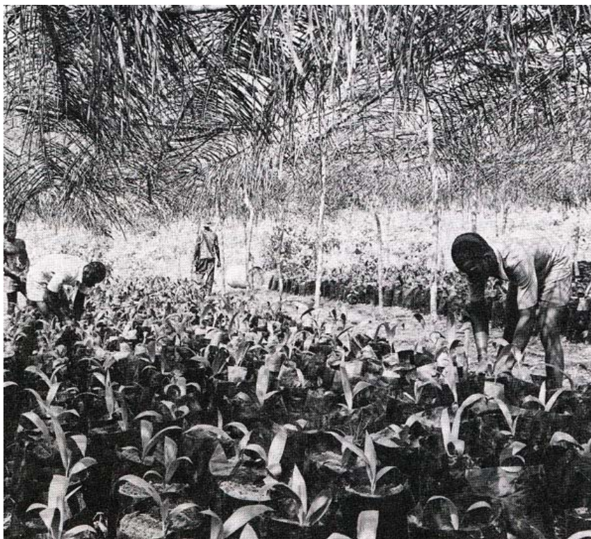
Fig. 2. Three-month-old oil palms in a government-sponsored nursery, Ivory Coast. They will be planted in plantations when about 8 months old.

The African oil palm is a heliophile, growing naturally in a coastal belt about 150 miles deep from Angola to Senegal, where it is often adventive on disturbed land. A similar species, Elaeis oleifera , is found in the New World, and is even better