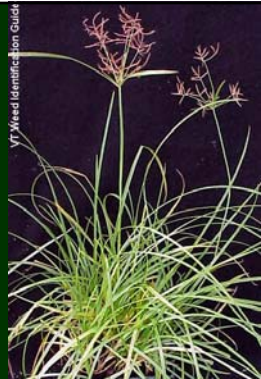
Purple nutsedge - The world's worst weed