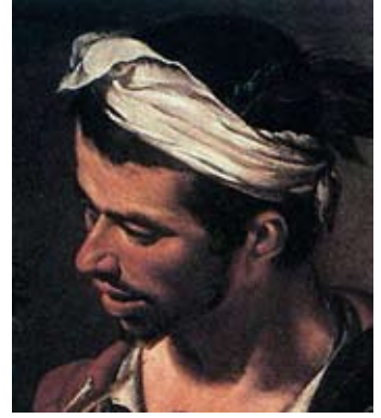
2) Ecco Homo 1605