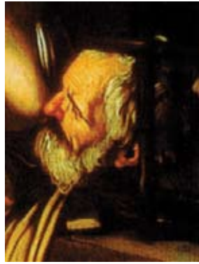
3) Seven Acts of Mercy 1606