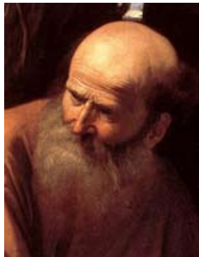
2) Sacrifice of Isaac 1603