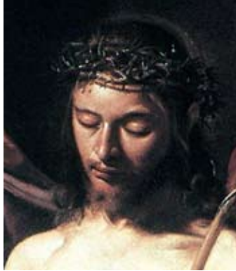
1) Ecco Homo 1605