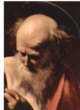
4) Saint Jerome Writing 1606