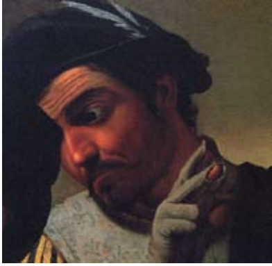
1) Cardsharps 1594