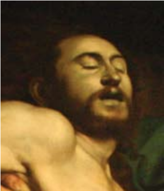
1) Entombment 1602-3