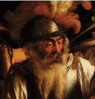
1) Conversion of Saint Paul 1600-1