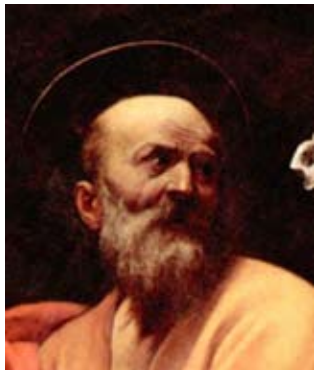
1) Saint Matthew and the Angel 1602