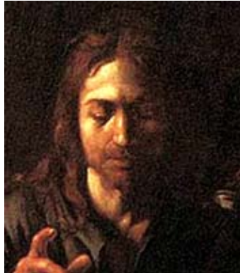
2) Supper at Emmaus 1606