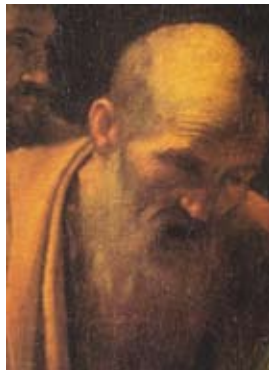
3) Death of the Virgin 1605