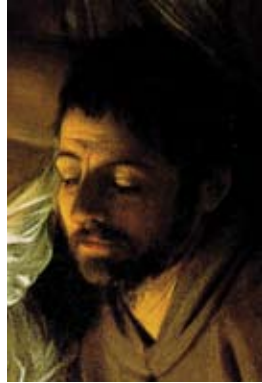
2) Saint Francis in Ecstasy 1595