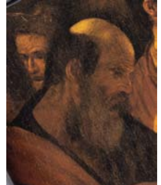
2) Death of the Virgin 1605