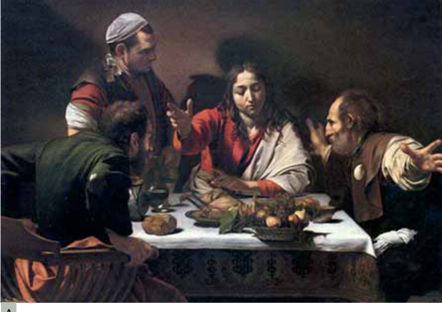
Figure 5. A. Supper at Emmaus; B. Close-up of fruit basket.

undated manuscript by P.A. Micheli (1679-1713), the first director of the Botanical Garden of Florence. The fig is native to the Mediterranean area, mentioned in an Egyptian stele about 2700 BCE, commonly referred to in the Hebrew Bible, and widely cited by Greek and Roman agricultural writers.