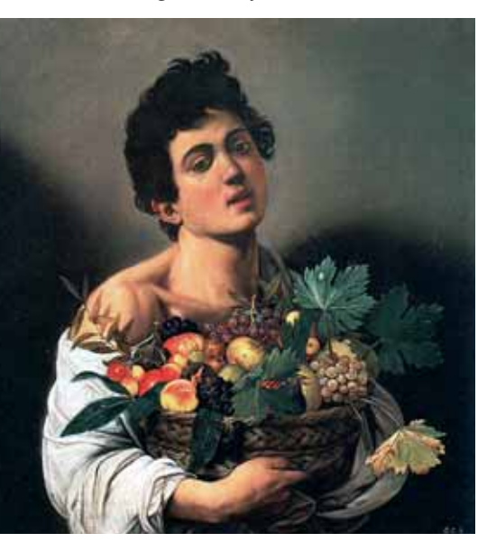
Figure 3. Boy with a Basket of Fruit.

one blushed and the other striped, and one yellow with a russet basin and a scar; two branches with small pears, one of them with five yellow fruits with a bright red cheek and the other, half-hidden, with small yellow, blushed fruits. There are also leaves showing various disorders: a prominent virescent grape leaf with fungal spots and another with a white insect egg mass resembling oblique banded leaf roller (Choristoneura rosaceana), and peach leaves with various spots. Incongruous-ly, there are two sprigs with reddish foliage, perhaps mint. While the display of fruits is beautiful, it does not have the super-realism characteristic of some of the later paintings.