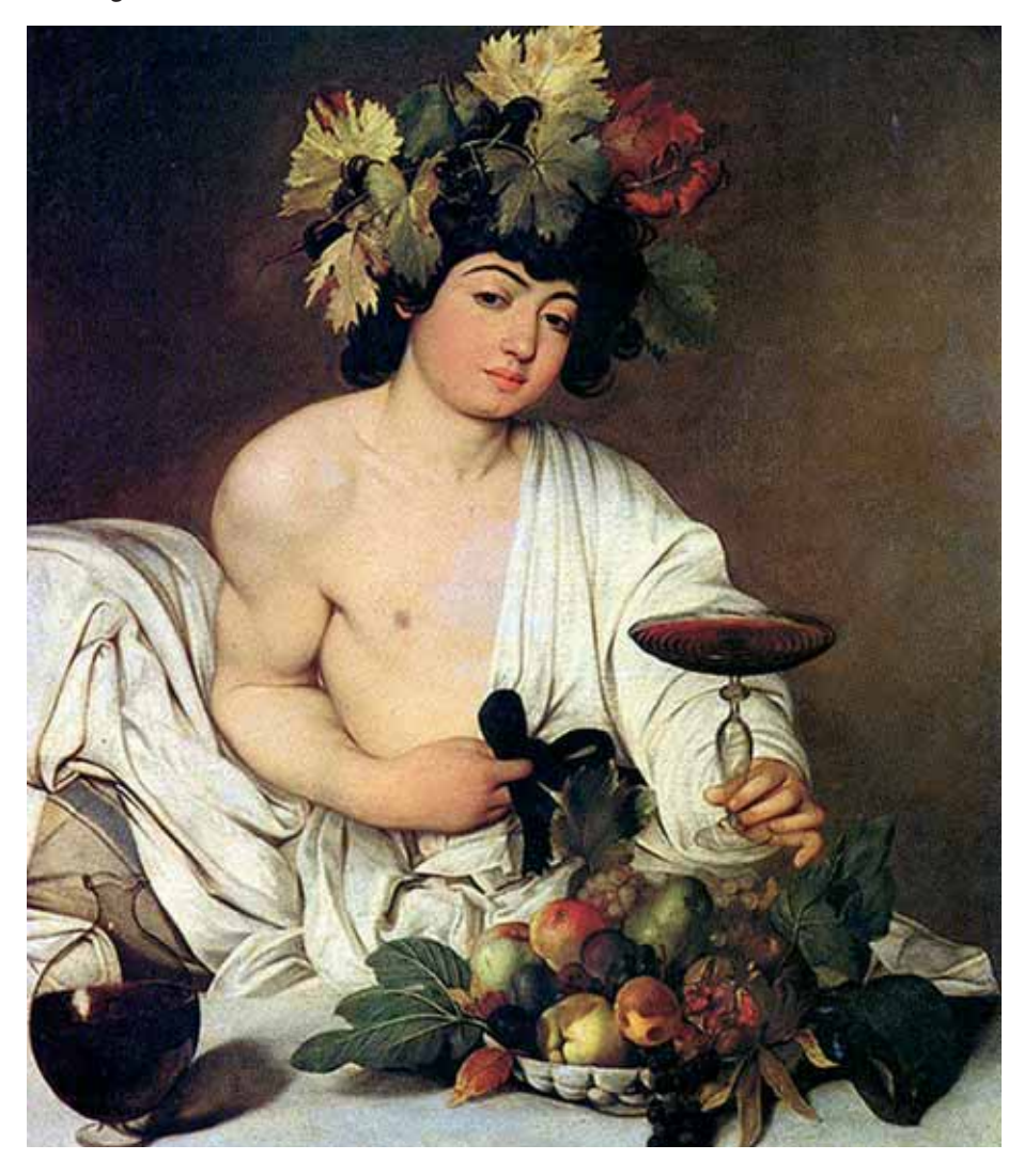
Figure 4. Bacchus.

Caravaggio, more if some questionable attributions are included (Fig. 8 and 9). Many are clearly different cultivars and a number show various biotic and abiotic defects. Viewed together, they represent a unique perspective on baroque horticulture between 1592 and 1603.