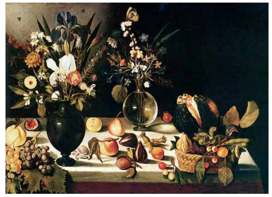
Figure 9. Still Life with Flowers and Fruits, attribution.

There are many ways to interpret the fruits images of Caravaggio. Artistically they can be viewed for their beauty or for the painter's skill or style. Art historians are prone to interpret them symbolically including religious, philosophical, or erotic overtones. Horticulturally they can be viewed in the context of genetic diversity, biotic associations, or management practices. That these interpretations are not mutually exclusive, can be shown in an analysis of the painting Still Life with Fruits on a