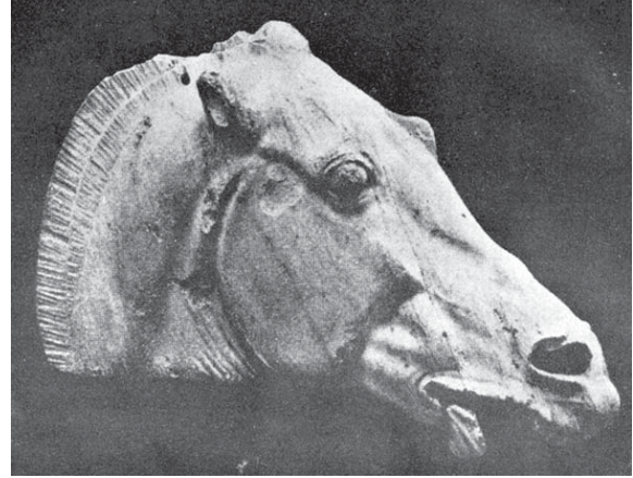
Fig. 17-2. Horse head from the Parthenon.

The museum became part of the palace, “the palace of culture,” and later a kind of medieval college and research institute. The development of the concept of organized centers of learning (the University) descend from this period.