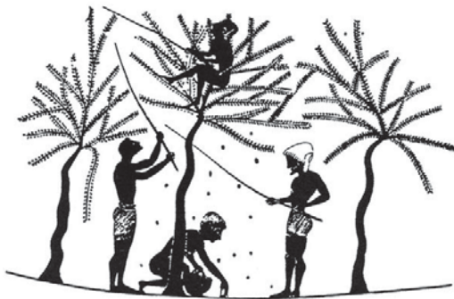
Fig. 17-3. Harvesting olives

Hippocrates (460?–359? BCE). Disciple of Democritus, was a Greek physician who is now considered the “Father of Medicine.” Born on the Island of Cos, he was associated with the cult of Asclepius, the Greek god of healing whose staff entwined with a serpent became the symbol of medicine. In the 7th century BCE, Asclepius aided by his two daughters, Hygeia and Panacea, superseded Apollo of the greatest of the healing gods, and temples in his name were built to heal the sick. Legend has it that the centaur Chiron taught Asklepius pharmaceutical knowledge about drug plants.