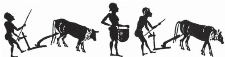
Fig. 17-4. Greek plow