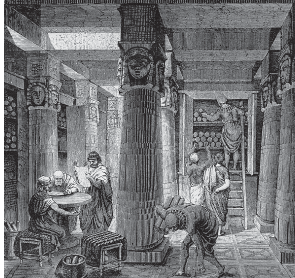
Fig. 17-5. Reconstruction of the library of Alexandria.