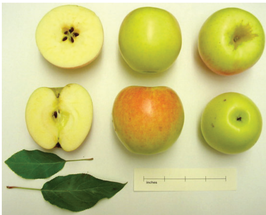
Fig. 1. 'Co-op 29' (Sundance™) apple.

Keeping quality: Fruit remains fresh for ≈1