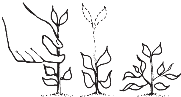
Figure 3. Most annuals respond to an early "pinch."

Most annuals benefit from pinching (see Figure 3), resulting in more flowers during the growing season, even though it may remove blooms initially. The first pinch should remove the top inch or two from the growing tip, leaving 3 or 4 leaves. Greenhouse-grown transplants have usually been pinched by the grower so check the plants at purchase time. Many annuals that bloom all summer will benefit from additional pinching throughout the summer to keep them compact and full of blossoms.