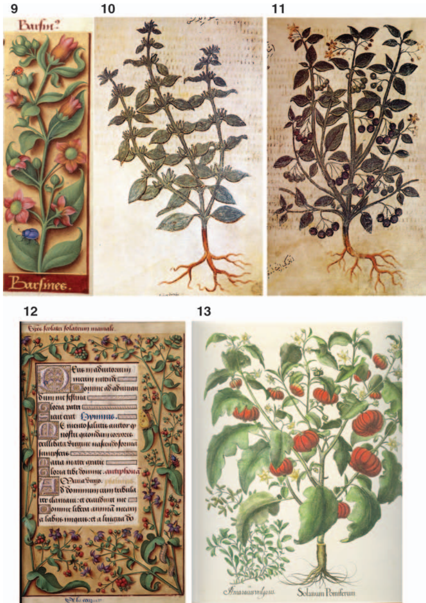
Plate 1.9-13. (9) Belladonna. Manuscript Latin 9474 Horae ad Usus Romanum, fol 237, ca. 1503–1508. (10) Putative Withania somnifera. Codex Aniciae Julianae, folio 386, 512 CE. (11) Solanum nigrum. Aniciae Julianae Codex, folio 292v, 512 CE. (12) Solanum dulcamara. Manuscript Latin 9474 Horae ad Usus Romanum, fol 59, ca. 1503–1508. (13) Solanum aethiopicum Kumba Group, Besler, Tafel 322 (1613).